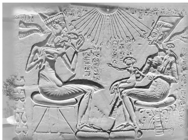
Fig. 1. An image showing Akhenaten, Nefertiti and three children exposing themselves and a house plant to the healing rays of sunlight. The religious symbols in the image suggest that the Ancient Egyptians venerated and worshipped the sun.

The Greeks and the Romans clearly recognized the healing power of the sun. They built solariums and sunbaths, and the Greeks even used them to enhance the strength of athletes preparing for the Olympic Games by exposing them to several months of sunlight treatment. The word, heliotherapy, actually derives from the Greek name for their sun god, “Helios”; heliotherapy meaning sunlight therapy [23–26]. Furthermore, Ayurvedic medical records show that as far back and 1400 BCE; Hindus used the combination of sunlight and photosensitive herbs, such as furocoumarins, to treat vitiligo and other conditions—a combined treatment, which many refer to today as photodynamic therapy [27]. Moreover, records indicate that heliotherapy was a