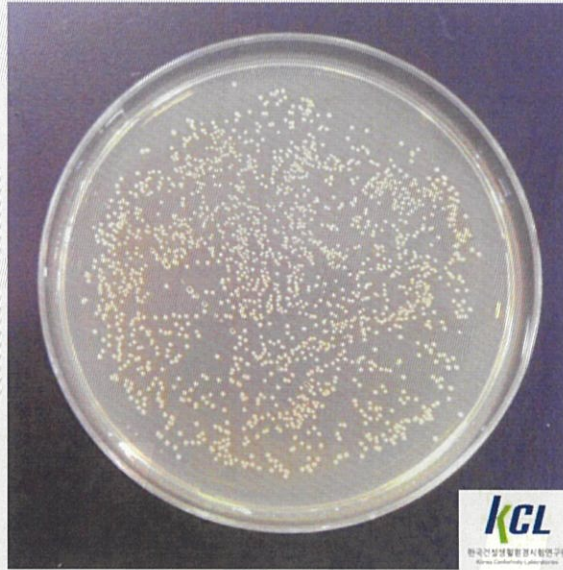
<Picture 1. MRSA( Staphylococcus aureus subsp. aureus ) - BLANK (0 h)>