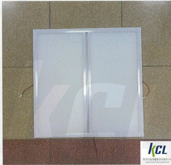
<Picture 3. Sample[CLEAN EDGE(Office lighting with the visible spectrum for Sterilization)]>